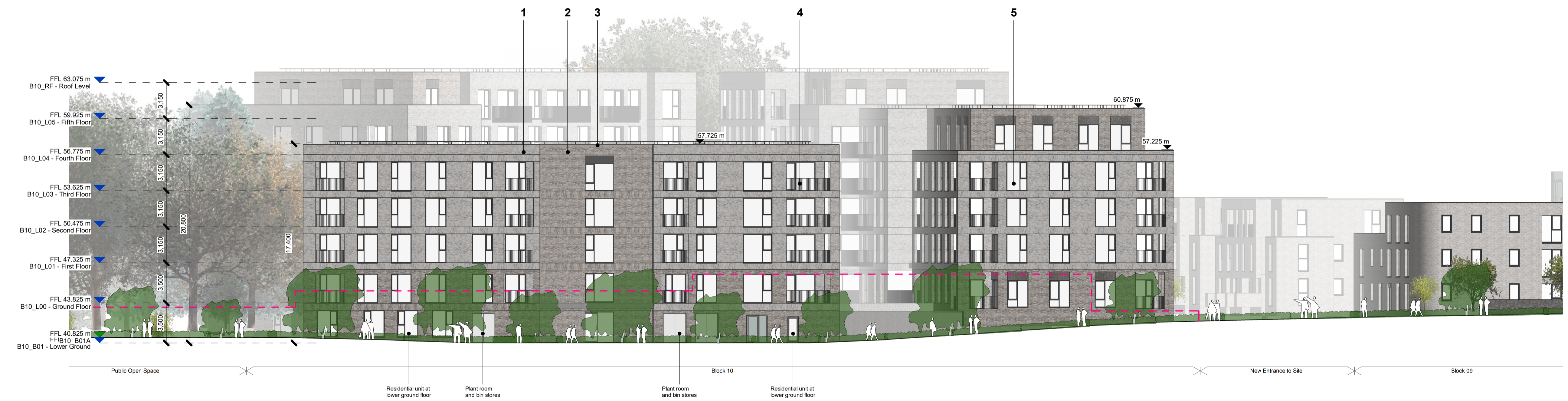
West Elevation 1 : 200