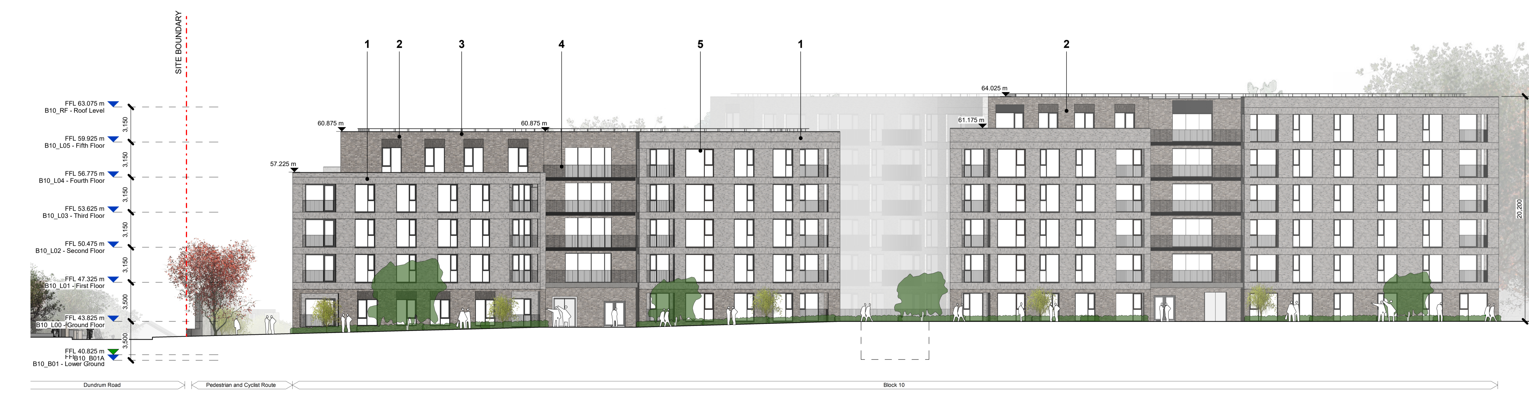
South Elevation 1 : 200